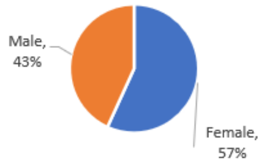
Lower Middle Quartile